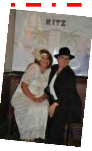
Page 15 of 23